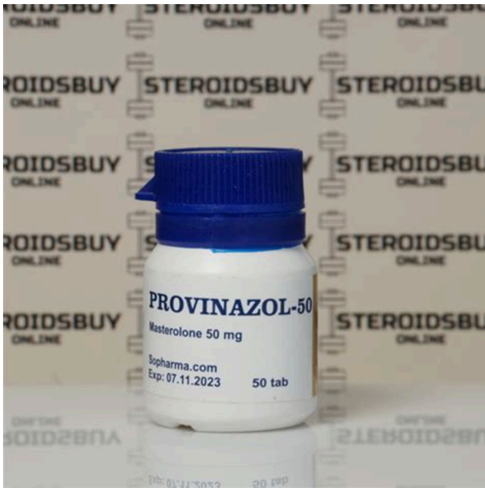
Testosterone Propionate -

Testosterone Phenylpropionate - Testosterone Isocaproate - Testosterone Decanoate 300 mg. SUSTANOM 300mg is a testosterone blend that contains four different testosterone esters. SUSTANOM 300mg is designed to provide a fast yet extended release of testosterone. This product is manufactured by using technologies of. Testosterone Phenylpropionate - 60 mg. Testosterone Isocaproate - 60 mg. Testosterone Decanoate - 100 mg. Testosterone is the most common anabolic hormone that there is and is also considered the most basic. Due to this, bodybuilders often consider it the base steroid to most all cycles. Testosterone is both anabolic and androgenic in nature.