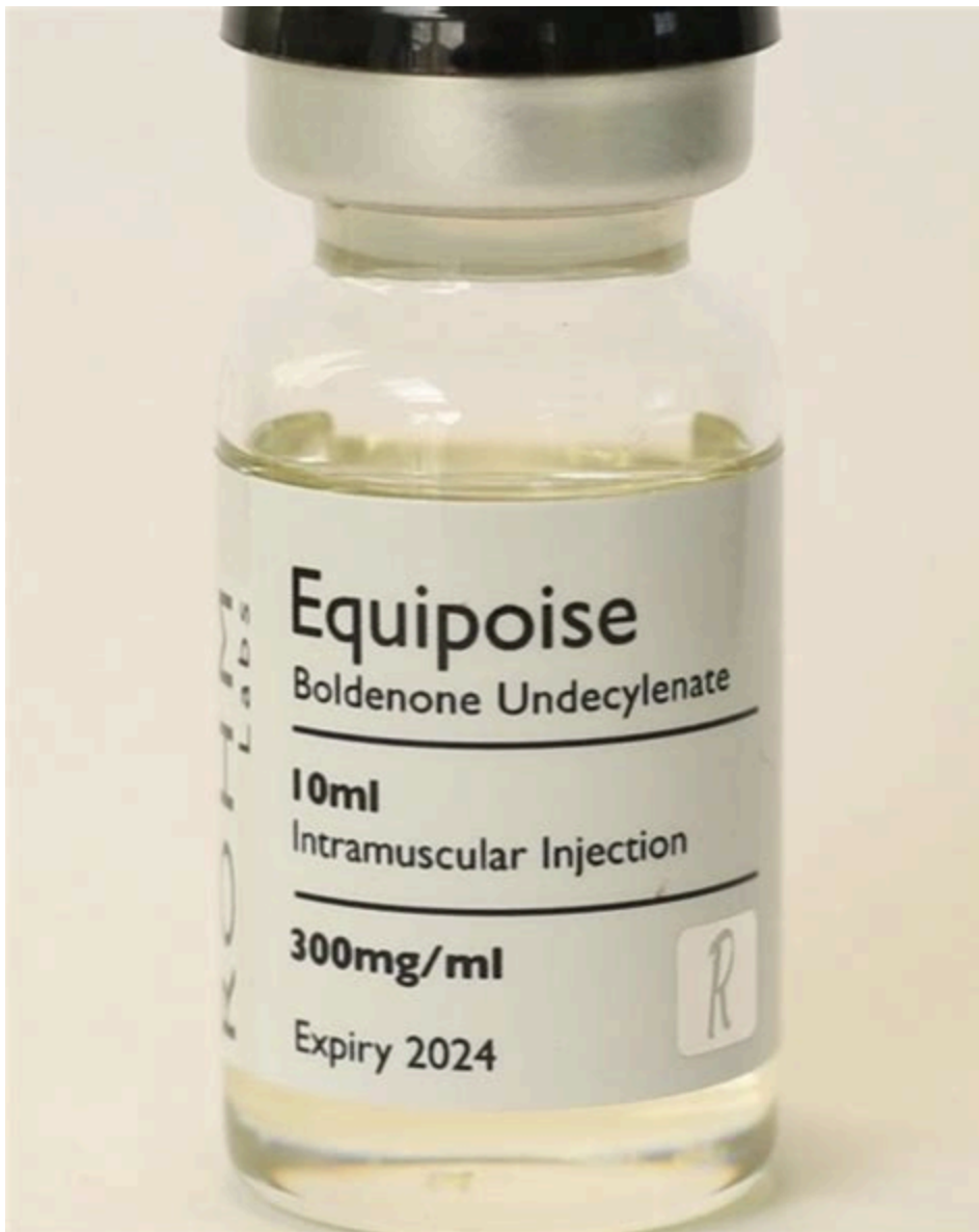
Cernos Capsule 10'S.

Hormonal Therapy Rx required. TESTOSTERONE 40MG. Best Price* ₹ 133.20 MRP ₹166.50 (Inclusive of all taxes) * Get the best price on this product on orders above Rs 750. *10 Capsule (s) in a Strip * Mkt: Sun Pharmaceutical Industries Ltd * Country of Origin: India * Delivery charges if applicable will be applied at checkout. Name: Cernos 40mg Capsule Manufacturer: Sun Pharmaceutical Industries Ltd MRP: Rs. 139.00 Unit Price: Rs. 13.90 Package Price: Rs. 139.00 (Qty.: 10)