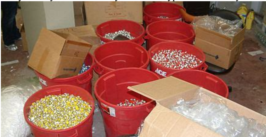
Trenbolone / Winstrol Cycle.

Be careful, Tren/Winny can have harmful side-effects. I did the following cycle: Weeks 1 - 8: 100mg Prop ED/100mg Tren ED Weeks 8 - 12: 100mg Tren ED/100mg Winstrol Oral ED My muscles were so goddamn tight by Week 10, I thought my skin was going to rip during bicep curls. I wouldn't do oral Tren if you if was free AND you paid me. It is THE most toxic oral AAS out there today. Id rather do a pro hormone, which i hate and will not do, than oral Tren. Honestly, after doing even a rudimentary search on this subject, you would have to have rocks in your head to put that shyt into you body and consciously inflict that type of assault on your liver.