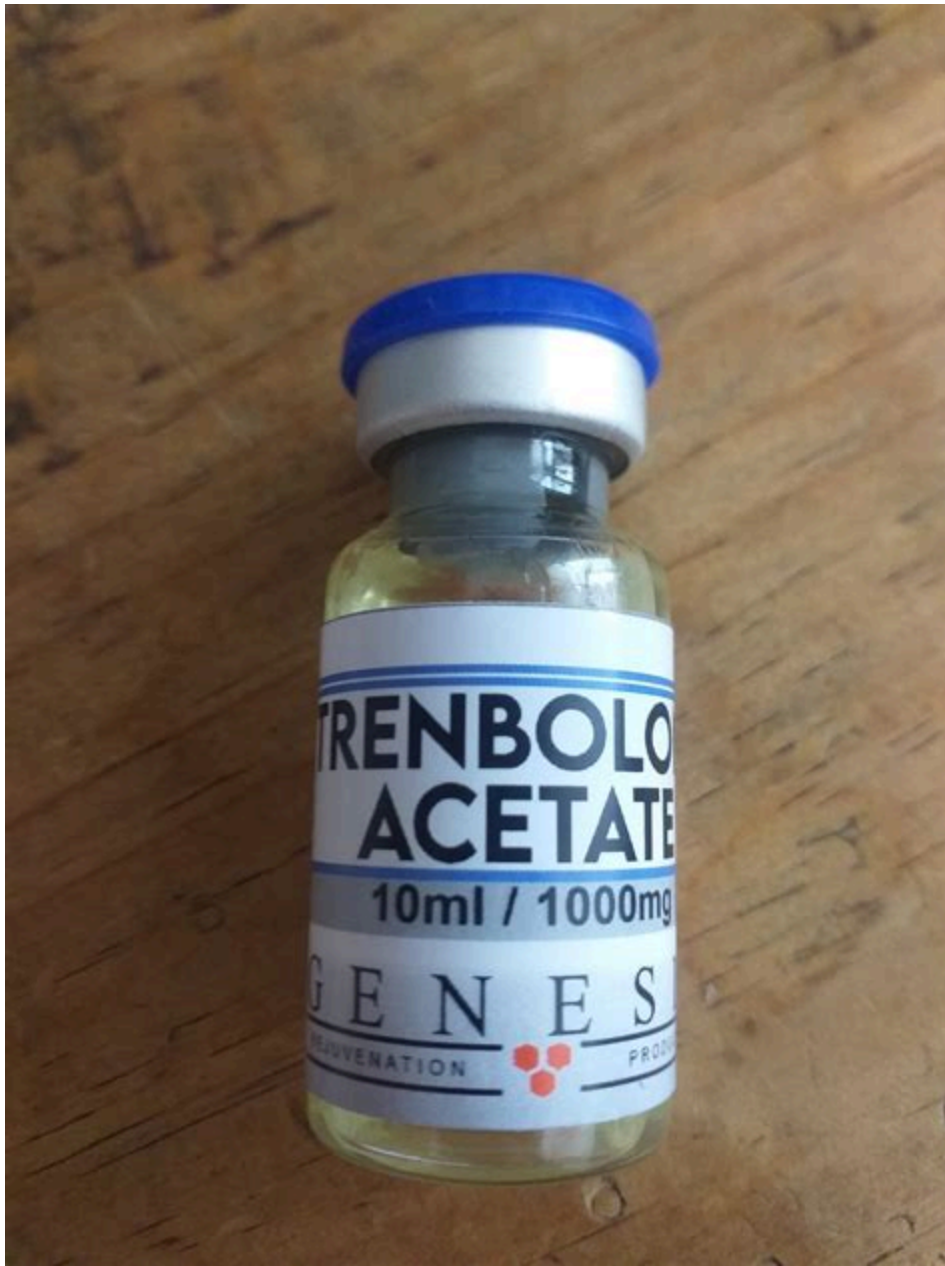
Dragon Pharma Dianabol

50mg is on sale for 50% off until Oct 04, 2021 because it was voted 'Product of the week'. Use the following link to find the product: Dragon Pharma Dianabol 50mg Once you make your first order you'll be able to vote yourself on which item you'd like to see as the item of the week. Item with the most votes gets discounted for 50% off for a week. get redirected here