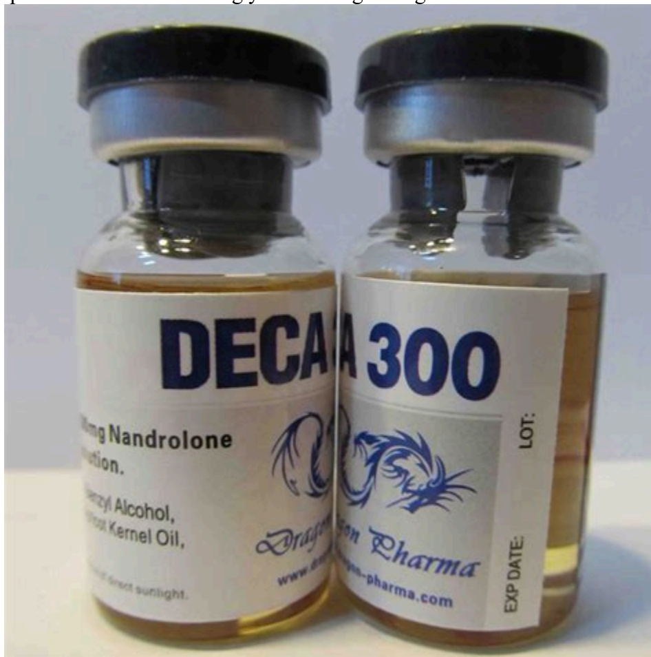
dragon pharma, anavar jiu

questions about -- ensuring you're taking the right medication.