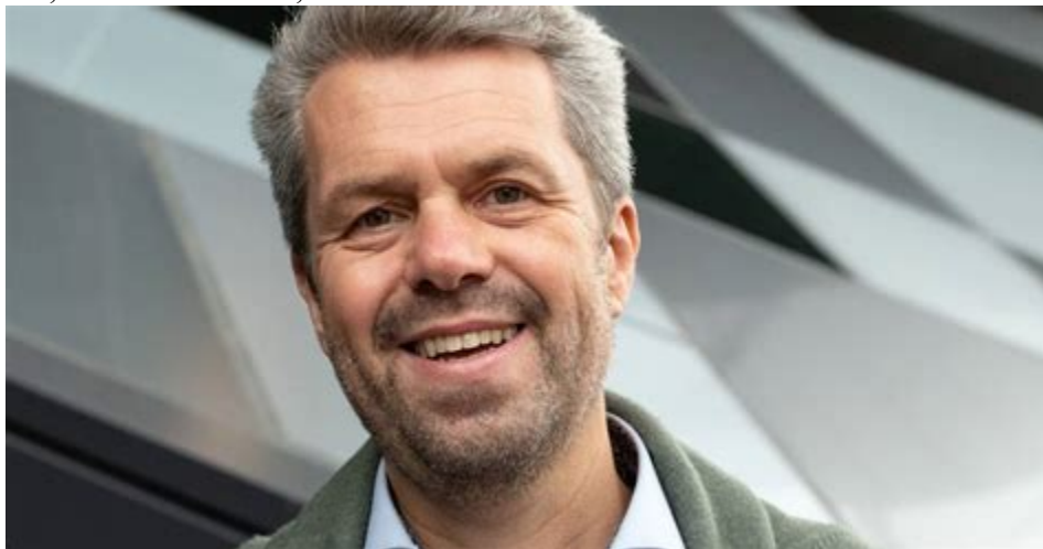
Genotropin Cena W Aptece -

sustanon 250 kaufen, sustanon 250 lietuva, test sustanon 250 first. cycle, sustanon cena w aptece, sustanon 350 xerium, testosterone. sustanon 250 dosage, sustanon plus deca, hi tech pharmaceuticals. sustanon 250, sustanon 250 online india, trenbolone enanthate and. sustanon 250, sustanon 350 prius lab, sustanon bd 250, sustanon 275